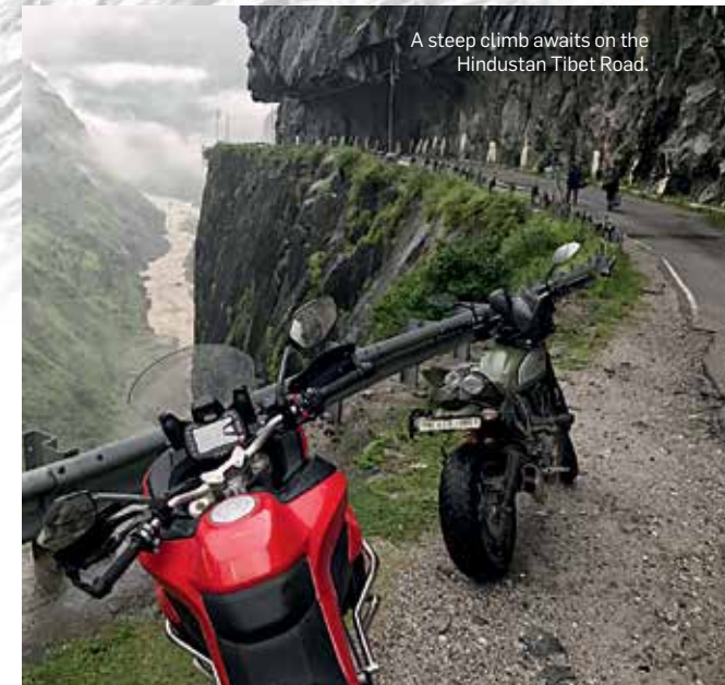
A steep climb awaits on the Hindustan Tibet Road.

Between Kaza and Manali, we encountered pretty villages and no fewer than five serious river crossings. Slowly tipping over in an icy river is extremely painful. While it makes sense to cut off the engine at once to avoid water being sucked in, this is as easy as hitting a snarling bear on the nose. Be that as it may, we crossed these obstacles with the help of our experienced lead biker. A non-existent 'road' followed—it's just one hairpin bend after another of loose gravel—and lead us up to Kunzum Pass . The views, however, are breathtaking. Distracted, I found myself too close to the edge and hit the brakes, too hard, perhaps. I landed under the bike with a twisted ankle and torn ligament. With no option, I picked up the bike and rode up and past the 3,978-metres-high Rohtang Pass , weaving blind through thick fog till the pitch darkness gave way to the clear skies of Manali and our den for our stop here. As you can imagine, the sparkling lights of The Himalayan ( thehimalayan.com ), the modern, luxury resort with stunning views of the Northwestern Himalayas, were a welcome sight.