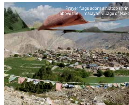
Prayer flags adorn a hilltop shrine above the Himalayan village of Nako.

An early start and we were off to the high reaches of Giu where we came across the monastery of 15 th -century Buddhist monk, Sangha Tenzin , whose mummy sits in an upright, meditative pose (one can still see his teeth!). We rode up and onward past the 1,000-year-old Tabo Monastery and the giant menhirs lining the road. Soft, off-road conditions meant a fast, enjoyable ride over loose surfaces and through many little streams leading up to Dhankar . Surrounded by a cold, lunar landscape, with the mighty River Spiti flowing in the valley below, this remote village is a sight to behold. It's home to one of the most beautiful monasteries in the world, hence its name—the word 'dhan' means cliff and 'kar' means fort; together, they form 'fort on a cliff'. Reaching Kaza , we refuelled at the world's highest petrol pump and spent the night at the lovely Sakya Abode ( sakyabode.com ).